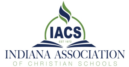
IACS Division 2 Tournament Bracket